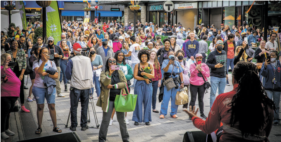
Boston attracted visitors in April 2022 with the Boston Blooms Block party in Downtown Crossing. Above, a letter to the editor makes other suggestions.